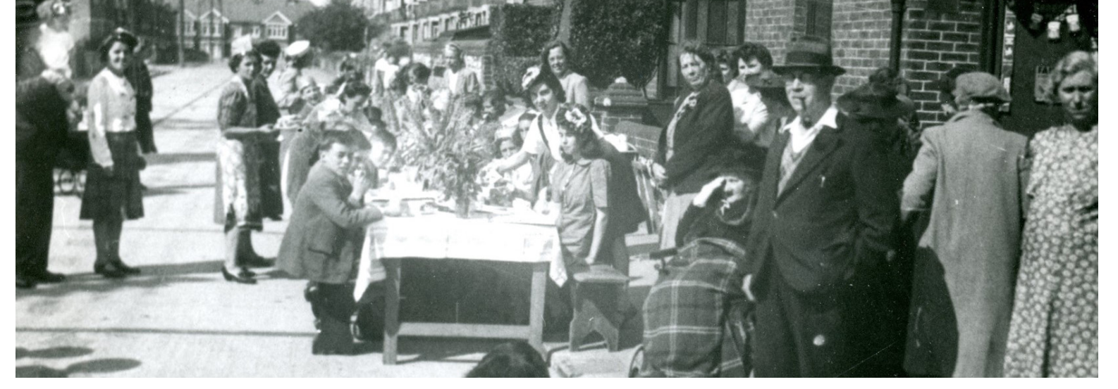
The next crafts have been inspired by this wonderful photograph from our archives of VE celebrations in North Ham Road.